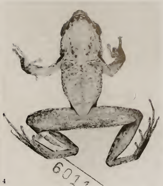
Figs 3, 4. Mantidactylus zolitschka , spec. nov. Preserved male holotype (ZFMK 60110). 3. Dorsal view. 4. Ventral view.